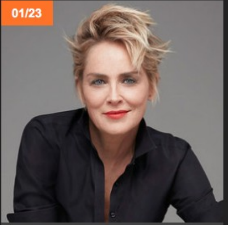
Sharon Stone Luke Evans